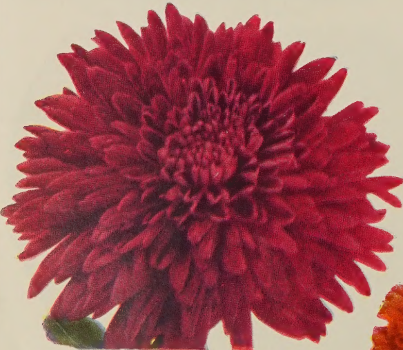
ROYAL ROBE 75c each; 3 for $2.00